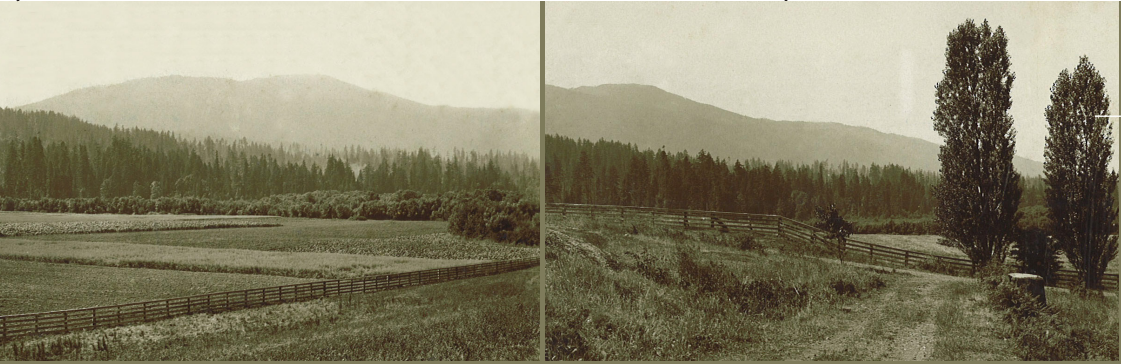
Company Farm, ca 1913 Established in 1892, the Company Farm provided fodder and pasture for the mules and horses that worked underground hauling coal cars in the local mines.